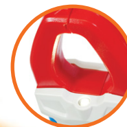
Meter includes flash light to light up area of test