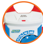
Red Light indicates detection of Non Contact Voltage (NCV)