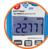
4000 Count Backlit LCD Display