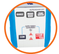
Rear entry of standard 4mm Test Lead Terminals