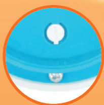
Adjustable Lux From 5 to 50