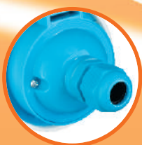
IP54 Water & Dust Resistant for Outdoor Use