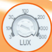
Adjustable Lux Settings from <3 to 500 Lux