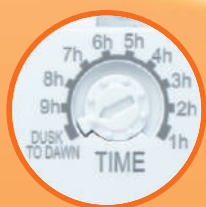
Built-in Preset Timer Settings from 1 to 9 hours or Dusk to Dawn