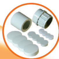
Adaptors & Covers Included