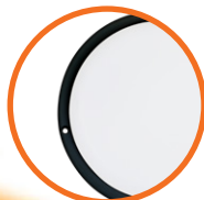
Maintains Weatherproof Protection with Pre-Made Screw Holes