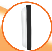
IP54 - Slim and Elegant Design