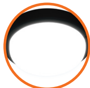
Bright Cool White Light

MBHR-12CB | 1080Lm/ 12W Round LED Bulkhead