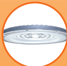
Ultra Slim Modern Design