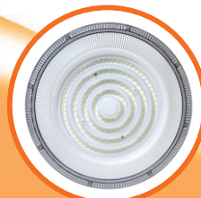
Concentric Lens Design for Efficient, Even & extremely Bright Light Distribution