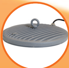
Die-cast Aluminium Body designed for effective heat dissipation