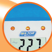
Correct Wiring Indication