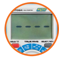
Non-Contact Voltage Detection Beeper and Display indication