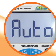
Smart Mode "AUTO" Function