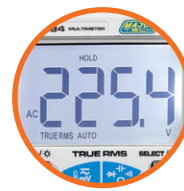
6000 Count Backlit LCD Display