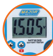
Easy to Read LCD Display