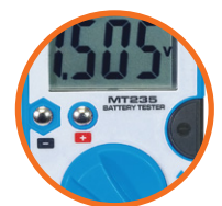
Measure with Test Leads or Slots