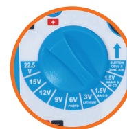
Easily Selectable Battery Types