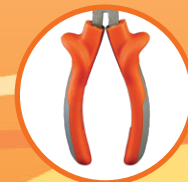
Heavy duty 1000V TPE handles